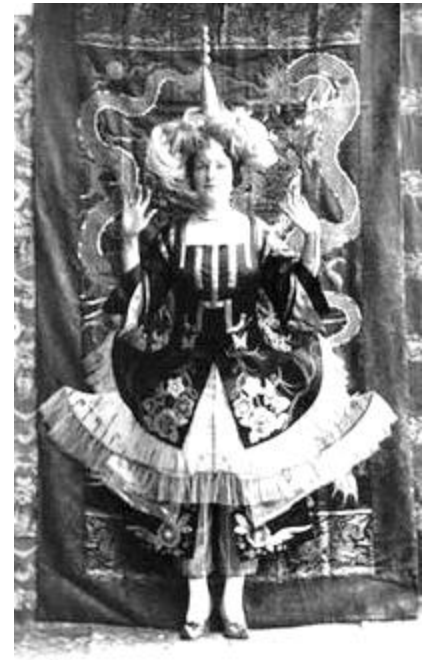
Lady Hortense Acton's wardrobe and interiors of Villa La Pietra